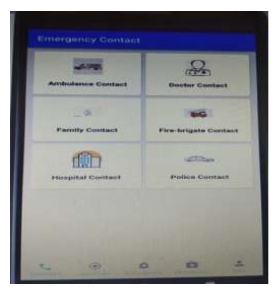
Fig-2: Emergency Buttons

In this login pages there two buttons one for Log in and another one for Sign up. If you already have an account then only you can click on login button rather than you have to create account on this application.